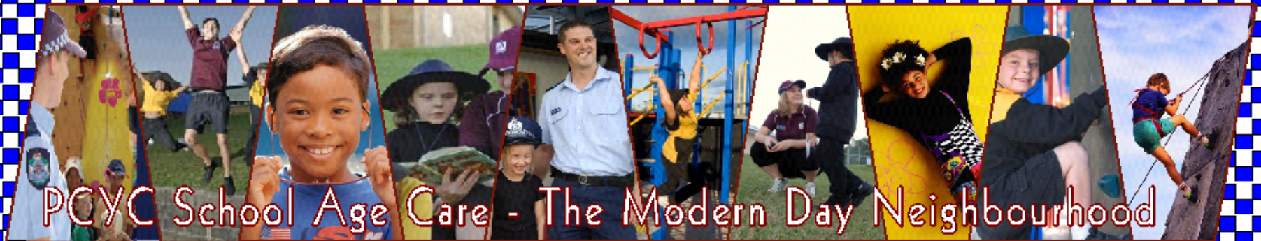
PCYC School Age Care - The Modern Day Neighbourhood