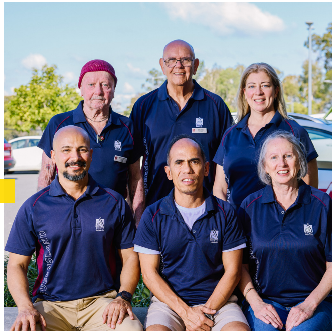
PCYC Logan's Braking The Cycle team