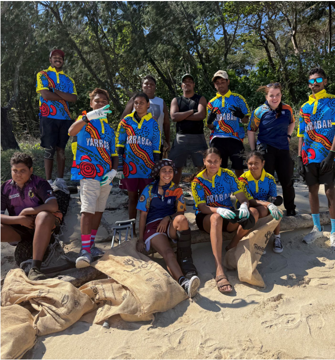
Above: ReefClean with PCYC Yarrabah's Youth Leadership Team at Green Island Below: PCYC Crestmead's Youth Leadership Team (left) and PCYC Mareeba's Youth Leadership Team (bottom right)

Our Youth Leadership Teams make a difference in all corners of Queensland, volunteering their time for a good cause: PCYC Yarrabah's Youth Leadership Team partnered with Tangaroa Blue for a Reef Clean, removing more than 100kg of marine debris from the reef; sorting, recycling and disposing of it. The YLT worked hard, ensuring the largest marine debris haul of any ReefClean at Green Island over the last 20 years. PCYC Crestmead's YLT is a diverse group who roll up their sleeves and offers help wherever it's needed, from packing emergency hampers for people experiencing homelessness in Logan, to washing PCYC vehicles, to supporting the annual CAOS community event. The YLT at PCYC Mareeba are always busy in the community, supporting events like the ANZAC Day Dawn Service, the local rodeo, Mareeba Child Protection Fun Day, assisting with club upkeep and cleaning, and washing our BTC vehicles.